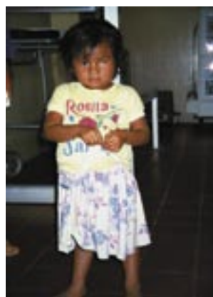
Little girl waiting to be seen.