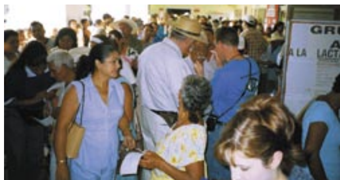
Photo of the waiting crowd at the hospital our first morning.

It was very rewarding to be able to help others from so far away.